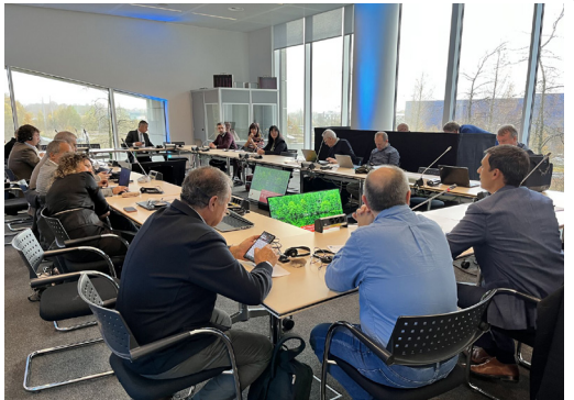
The €25 Billion Battle Took Place

Following the issuance of a one-year government bond in September 2023, with attractive tax incentives, \in 22 billion in retail funds shifted from bank accounts to the Belgian government. One year later, this money became the subject of even fiercer competition. The government claimed to improve competition on savings accounts. Factually, this did not work but triggered a shift of funds to other financial instruments, namely term deposits and certificates of deposit. ING and KBC announced they regained more than they had lost, BNP Paribas less, and Belfius appears to be "on par."